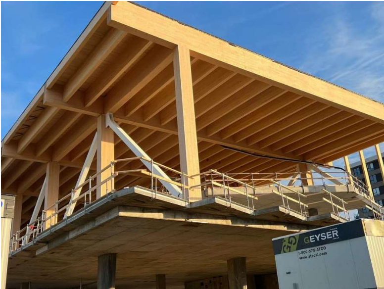
September 17, 2023