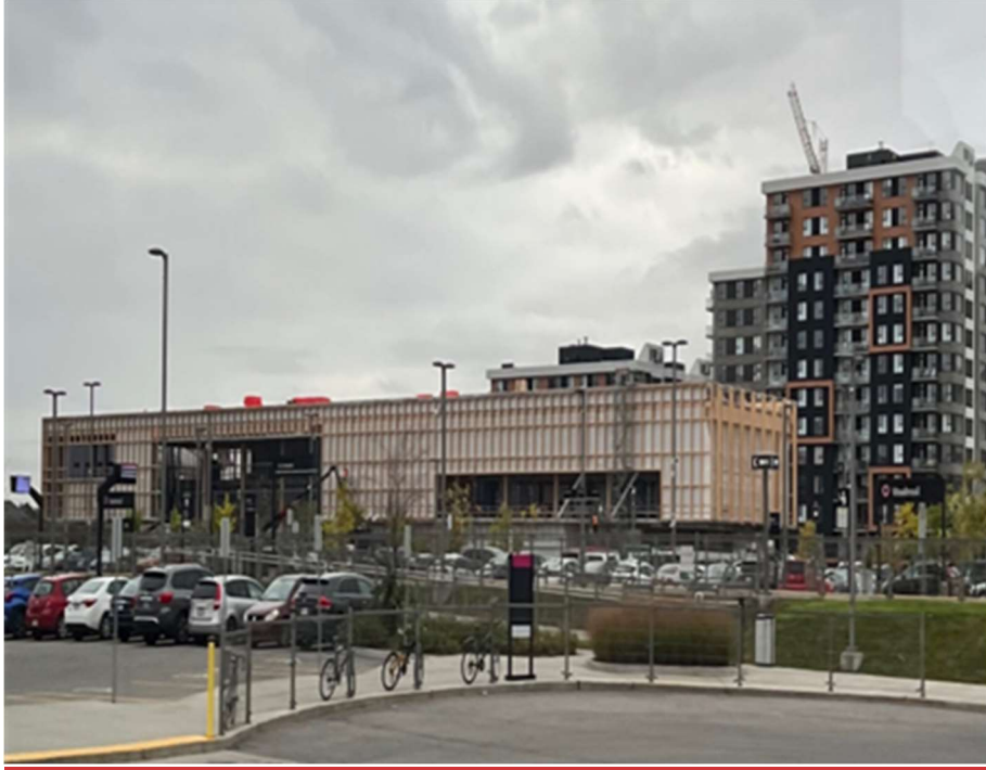
October 17, 2023