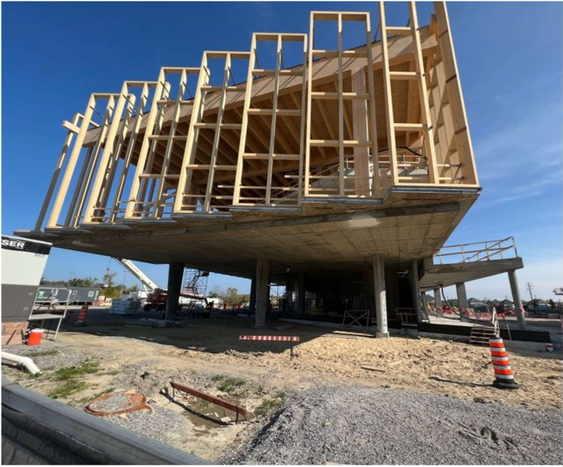
September 24, 2023