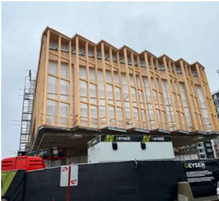
October 27, 2023